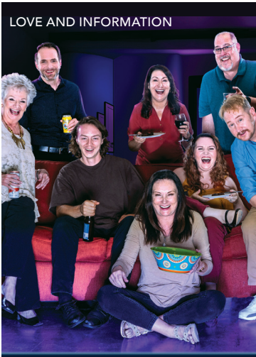
LOVE AND INFORMATION