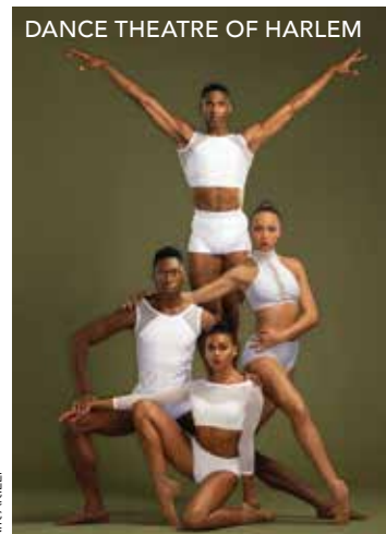
DANCE THEATRE OF HARLEM