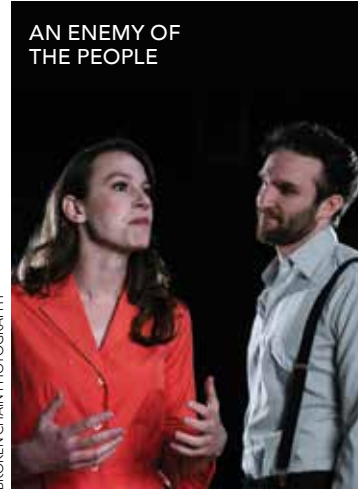
BROKEN CHAIN PHOTOGRAPHY

2900 Carlisle Blvd NE vortexabq.org | 505-247-8600