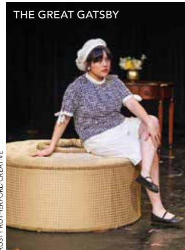
THE GREAT GATSBY

505-376-8366 | heartstringstheatre.com heartstringstheatrecompany@gmail.com